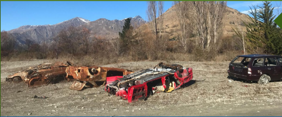
Cars abandoned on banded dotterel nesting habitat before restoration.