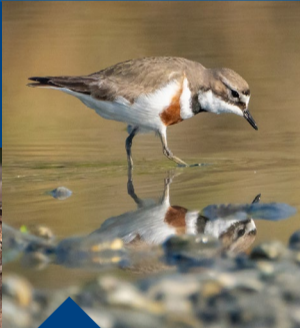
Banded dotterel at Tucker Beach Reserve.