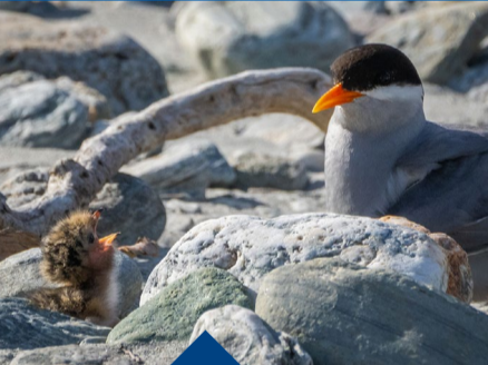
Black-fronted terns with chick.

This is a landscape that shifts, adapts and endures - and one that responds quickly when given the chance.