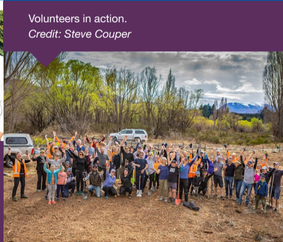
Volunteers in action.