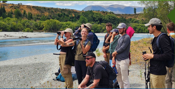
Bird watchers are attracted by a diverse assemblage of braided river birds, shags, kingfishers, and small passerines.

Just a few years ago, invasive weeds, illegal dumping and abandoned vehicles made the Tucker Beach Wildlife Management Reserve a place few people knew about and fewer still visited. Yet beneath this neglect lay a dynamic landscape, ecologically resilient and echoing with cultural significance. Today, the reserve is almost unrecognisable. The braided river birds are back. Native plants are taking hold. People are returning to walk, learn, and reconnect with the whenua. And at the heart of this transformation is a group of people who recognised this place as special and refused to give up on it.